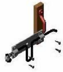
DETAIL A SCALE 1 : 8